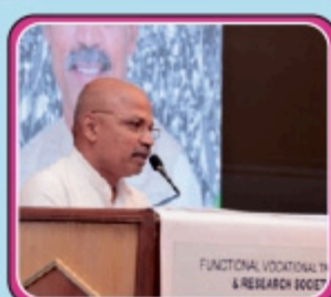
Dr. Sharanprakash Rudrappa Patil

Minister of Medical Education and Skill Development - GoK