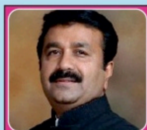
N A Harris

Minister of Medical Education and Skill Development - GoK